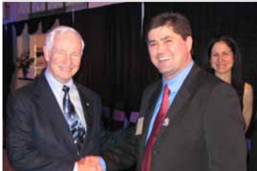
TOP: Gwich'in Gladiators Win Gold at the 2011 Yukon Native Hockey Tournament. BOTTOM: Meeting with the Governor General, his Excellency the Right Honourable David Johnston.